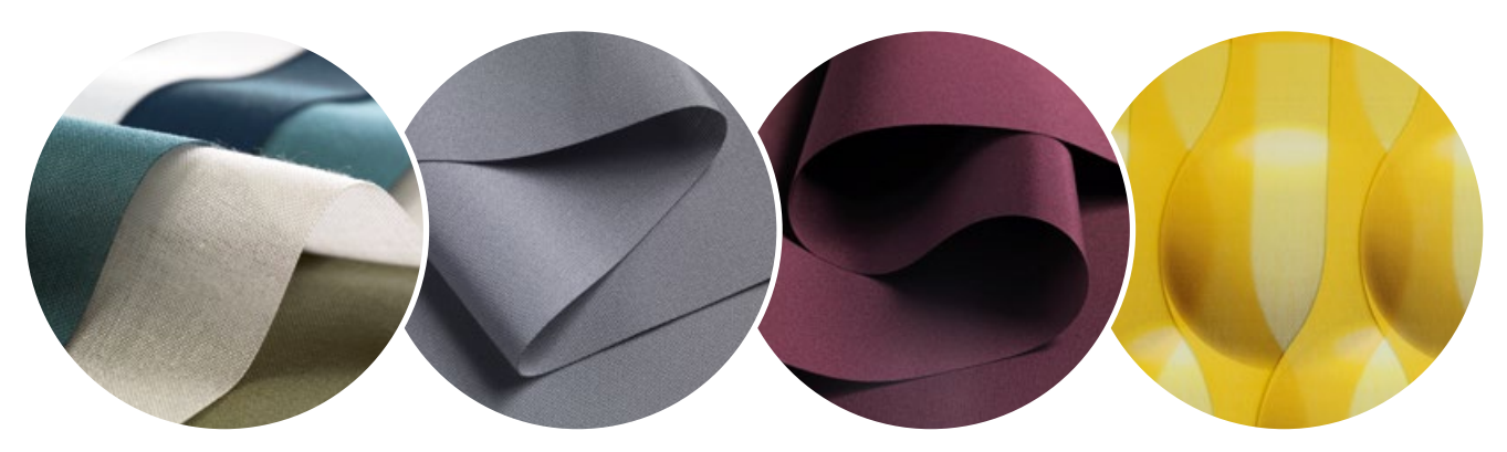
Our exclusive Colorama fabric is available in 30 colours and washable up to 72°

www Check out the Silent Gliss online fabric finder.