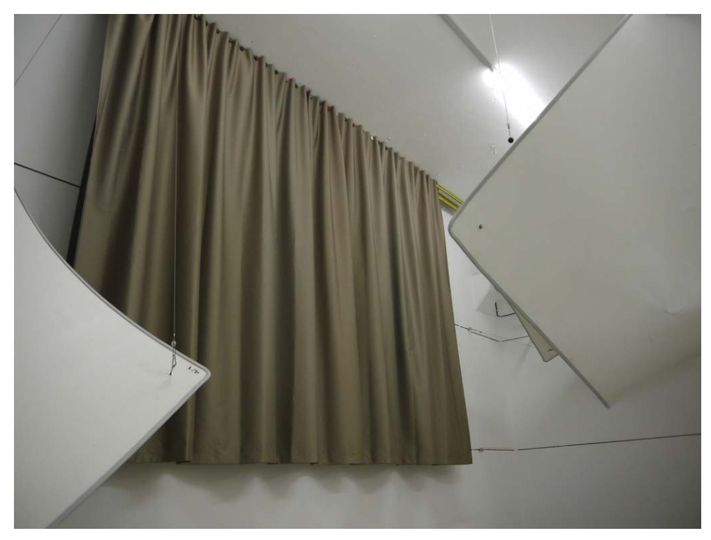
Figure B.2. Test object mounted in the reverberation room