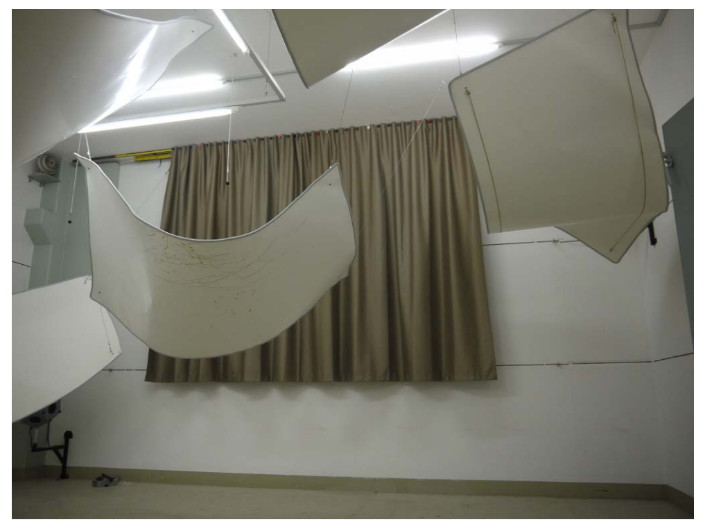
Figure B.1. Test object mounted in the reverberation room