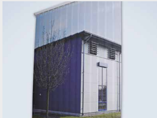
Vertical Blind louvres are suitable for digital printing as well.