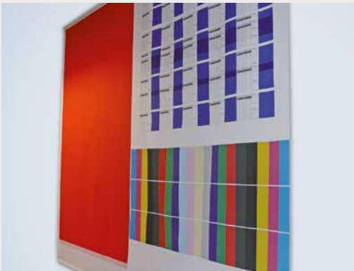
Holoedral printing – Fabrics can be printed over the entire surface with any kind of Pantone colour! Even a white print is possible.